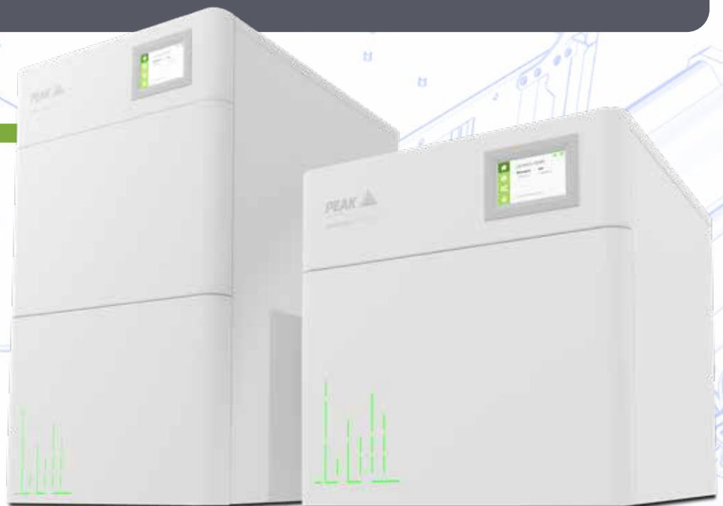
Genius XE 70

There are two models to suit your flow requirement, Genius XE 35 (up to a total of 35 L/min) and Genius XE 70 (up to a total of 70 L/min), both sharing many of the unique benefits with the main differences being size, number of internal compressors (2 and 4, respectively) and of course total output flow. The XE 70 is ideally suited to serving multiple instruments, eg. 2 or even 3 mass-spectrometers from one compact footprint solution.